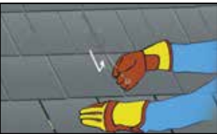
Slide new slate into place, then gently pull the Hook Pull until the Slate Repair Hook hooks the base of the slate. Remove Hook Pull , DO NOT OVER STRETCH .