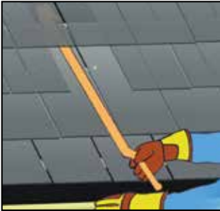
Remove broken slate