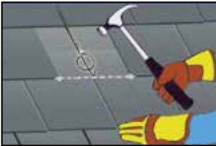
Position Slate Repair Hook between slates so that bottom hook is 10mm above the finished slate baseline and fix with a nail. Hang hookpull on hook.